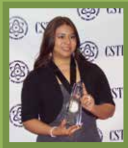
1 st place recipient of 21 st Annual Statewide Student Conference Oral Presentations

Support for CSTEP is provided by a grant under the Collegiate and Professional Development Programs Unit administered by the New York State Education Department.