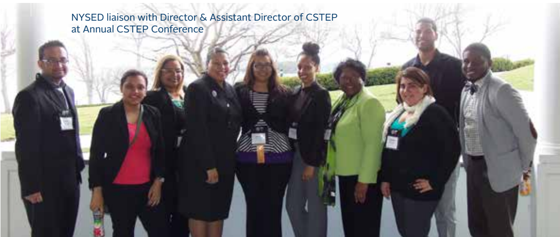
NYSED liaison with Director & Assistant Director of CSTEP at Annual CSTEP Conference

CSTEP is designed to afford students the opportunity to meet and build relationships with licensed professionals in CSTEP fields. Potentially, these professionals can serve as mentors, write recommendation letters and provide internship opportunities. In CSTEP, not only is it what you know— it's also whom you know.