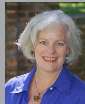
Dorothy Larkin Professor of Nursing